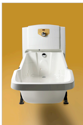
TR 900 Autofill model

Integrated with the TR 9560 Mobile patient combilift the system provides a safe moving and handling for both patient and attendant. During the bathing cycle the client never leaves the comfort and security of the chair or stretcher.