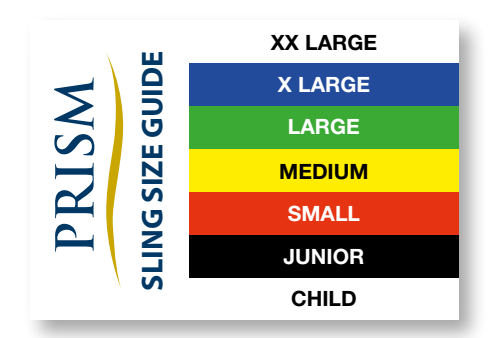
Sling size guide Is provided for reference on the boom of the hoist.

All Prism slings have colour coded bindings to indicate the sling size and unique colour coded loops to ensure the sling is correctly positioned and connected to the hoist.