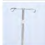
2 hooks 100005780