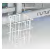
Urine bottle holder 128009790