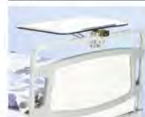
Monitor/ journal tray 128009769