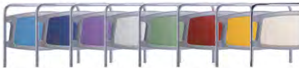
Standard 85 CM, A42179800