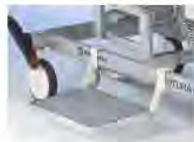
Step (suitable for fixed beds only) 100000760