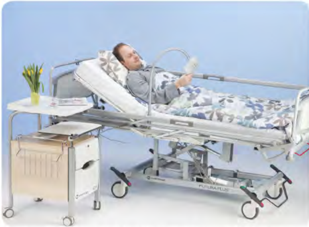
An adjustment panel for the patient is available as an optional accessory.