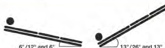
Reverse Trendelenburg, Trendelenburg