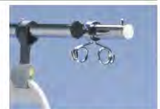
Infusion bag holder for lifting pole, 100000713