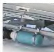
Oxygen bottle holder 5 kg 100005870