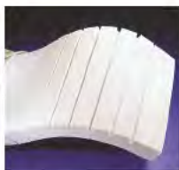
Mediflex Safe 2000x800x130 100000942 Also available as rescue mattress