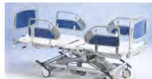
2 sectional side rail 100009760