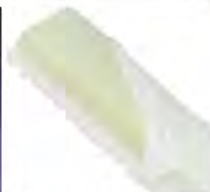
Mediform visco-elastic 2000x800x130 100000964 Also available as rescue mattress