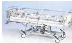
1-sectional foldable side rail A41974400