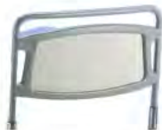
Foldable bed end 85 CM A42179900