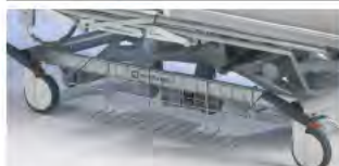
Bedside basket attached to lower frame, A41955500