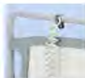
Hook for electrical cable A41987307