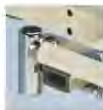
Adapter for Lift support and Patient control panel A43033900