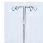
4 hooks 100000499