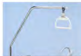
Lifting pole, with roll-up triangle A41884100 Adapter A42193400