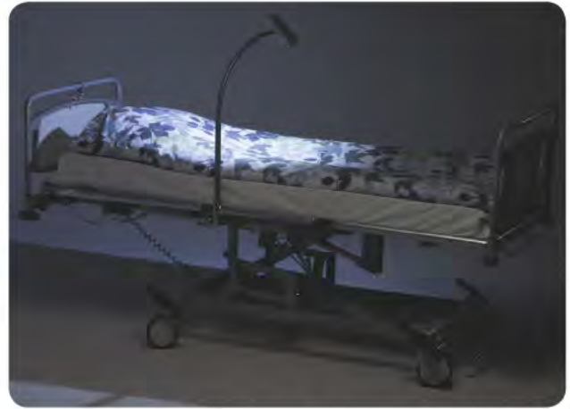
The same panel also doubles as a convenient reading light.