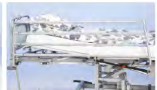
3/4 side rail A42999900