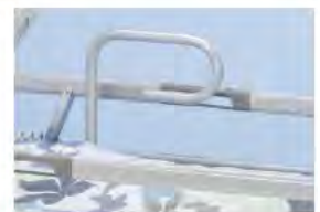
Lift support A41842500 Adapter A43033900