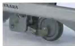
Optional fifth wheel A43036200