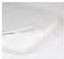
Basic 2000x800x120 100000967